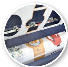
Waste matrix removal