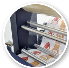
Laminating (SCR22PL and SCR35PL only)