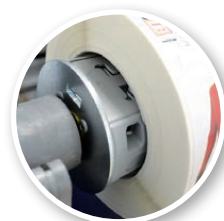
Rewinding to finished rolls