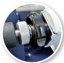
Core holder's clutch